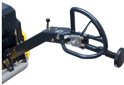
Precise and save to operate All function integrated in the steering rod head