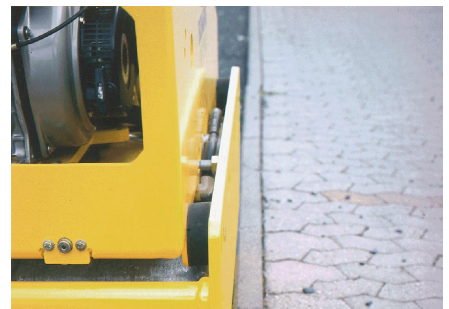
Simple and reliable to start Electric starter and hand starter