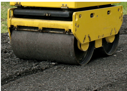
Higher compaction power and surface quality BOMAG double vibration