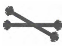
Heavy duty axle