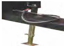
Vertical screw jack for easy parking