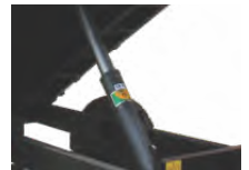
Telescopic hydraulic cylinder